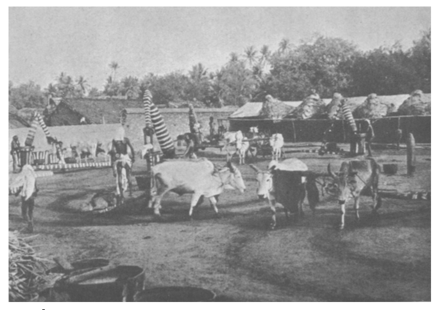
Ewing Galloway Primitive Methods of Pressing Sesame Seed in India

Digesting either at high or low pressures is resorted to in the case of similar material as is used in rendering, in those cases where hydrolysis is not of paramount importance. Digesting differs from rendering in that water, in some form or other, comes into intimate contact with the fatty material. The product is of a lower grade than that obtained under a first class dry rendering process but the process has certain well defined advantages. In the case of putrefied animal and fish tissue it is often the only commercial method of obtaining the oil or fat in a marketable condition, for it is possible by this method both to obtain the oil and at the same time