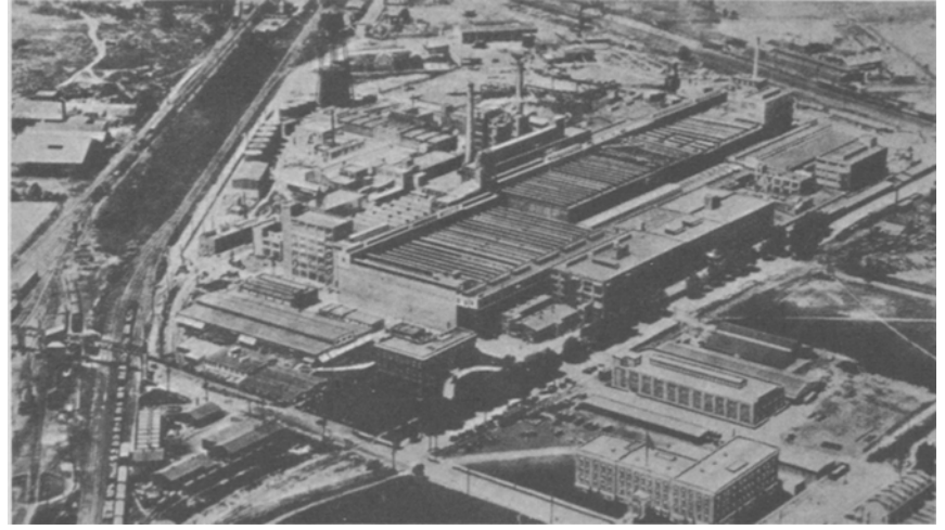
Aeroplane View of a Large American Linoleum Factory

drogen atoms attached to them are said to be unsaturated. If we can arrange to give these atoms their full complement of hydrogen we