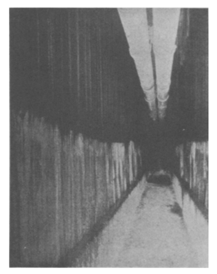
Interior View of Linoleum Oxidizing Tower

If instead of blowing the semidrying oils we had started with linseed oil, or better still, blown linseed oil we should have found that this oil behaves in the same manner and is capable of absorbing large quantities of oxygen and, if we had carried the experiment far enough, we should have found that at ordinary temperatures the product was quite solid. This oxidized boiled oil is prepared on a very